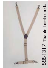
8881317 Tirante loneta crudo

Cada una de las partes del delantal se venden por separado