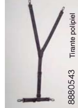
8880543 Tirante polipiel