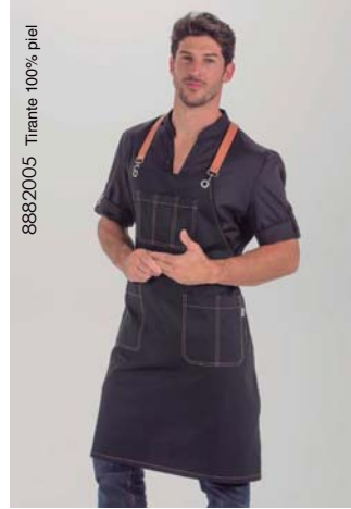
8401701 Solo delantal negro